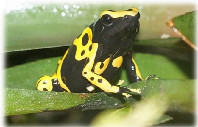
Poison Dart Frog