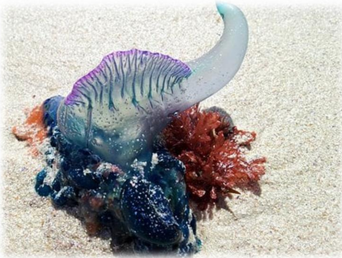
Portuguese Man O' War