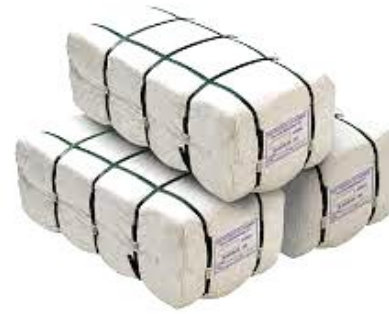
A bale of cotton