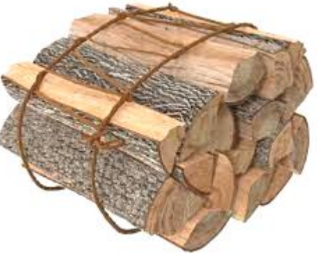
A bundle of sticks