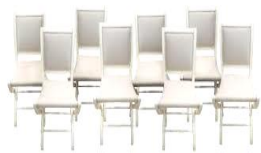
A fold of chairs