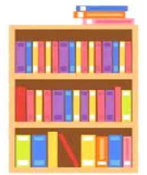
A library of books