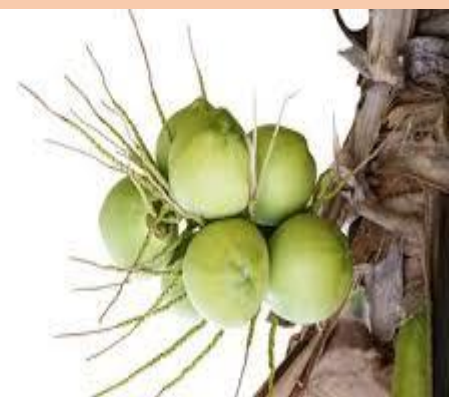
A cluster of coconuts