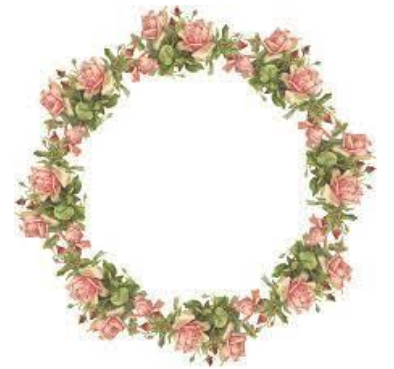
A bouquet of flowers