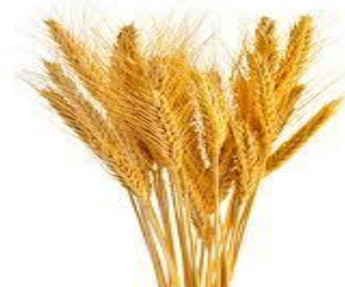
A sheaf of wheat