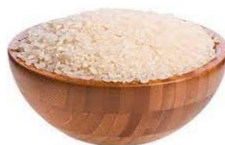
A bowl of rice