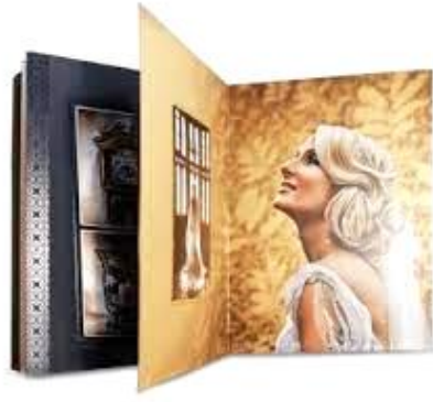
An album of photographs