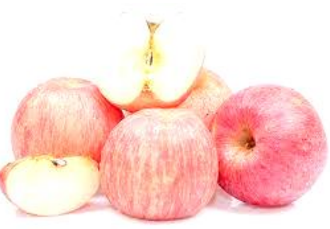
A crop of apples