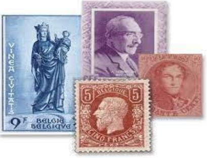
A collection of stamps