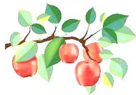
An orchard of fruit trees