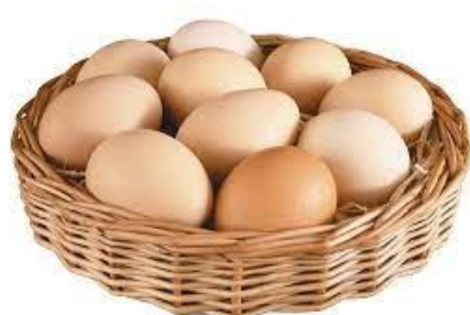
A clutch of eggs