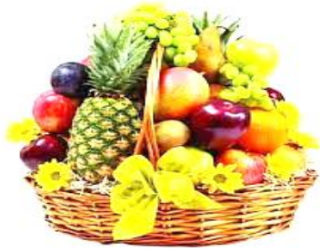
A basket of fruit