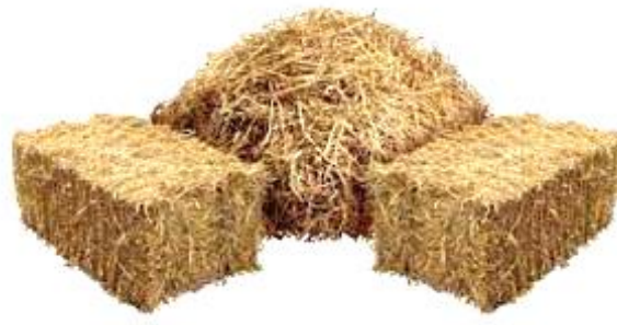
A stack of hay