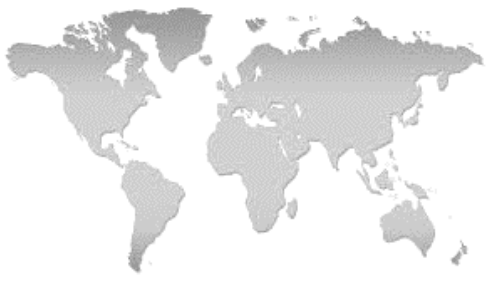
An atlas of maps