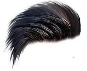
A mass/ tuft of hair