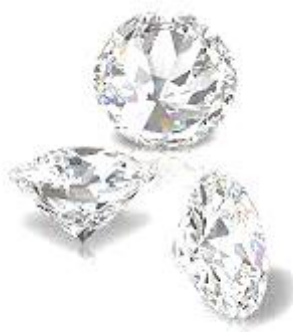
A cluster of diamonds