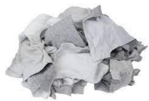
A bundle of rags