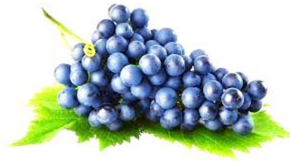
A bunch of grapes