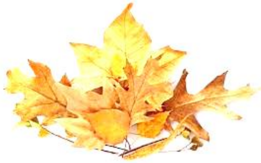
A pile of leaves