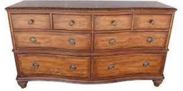
A chest of drawers