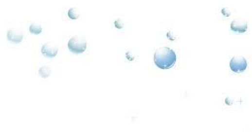
A fall of snow