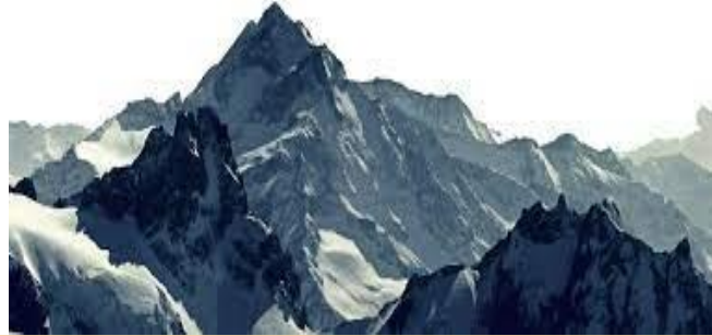
A range of hills