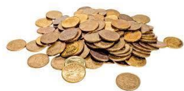
A collection of coins