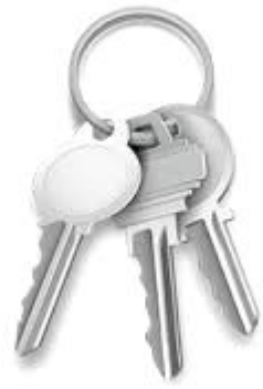
A bunch of keys